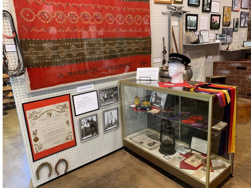
Robison display at the Tremont Agricultural Heritage Museum